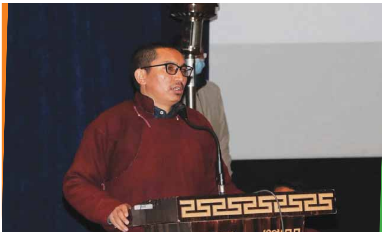
Shri Jamyang Tsering Namgyal, Member of Parliament, Ladakh at the launch of NCW's 'Empowering Women through Entrepreneurship' program in Leh