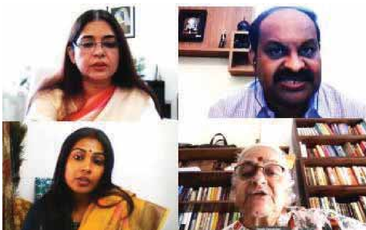
Webinar on National Education Policy