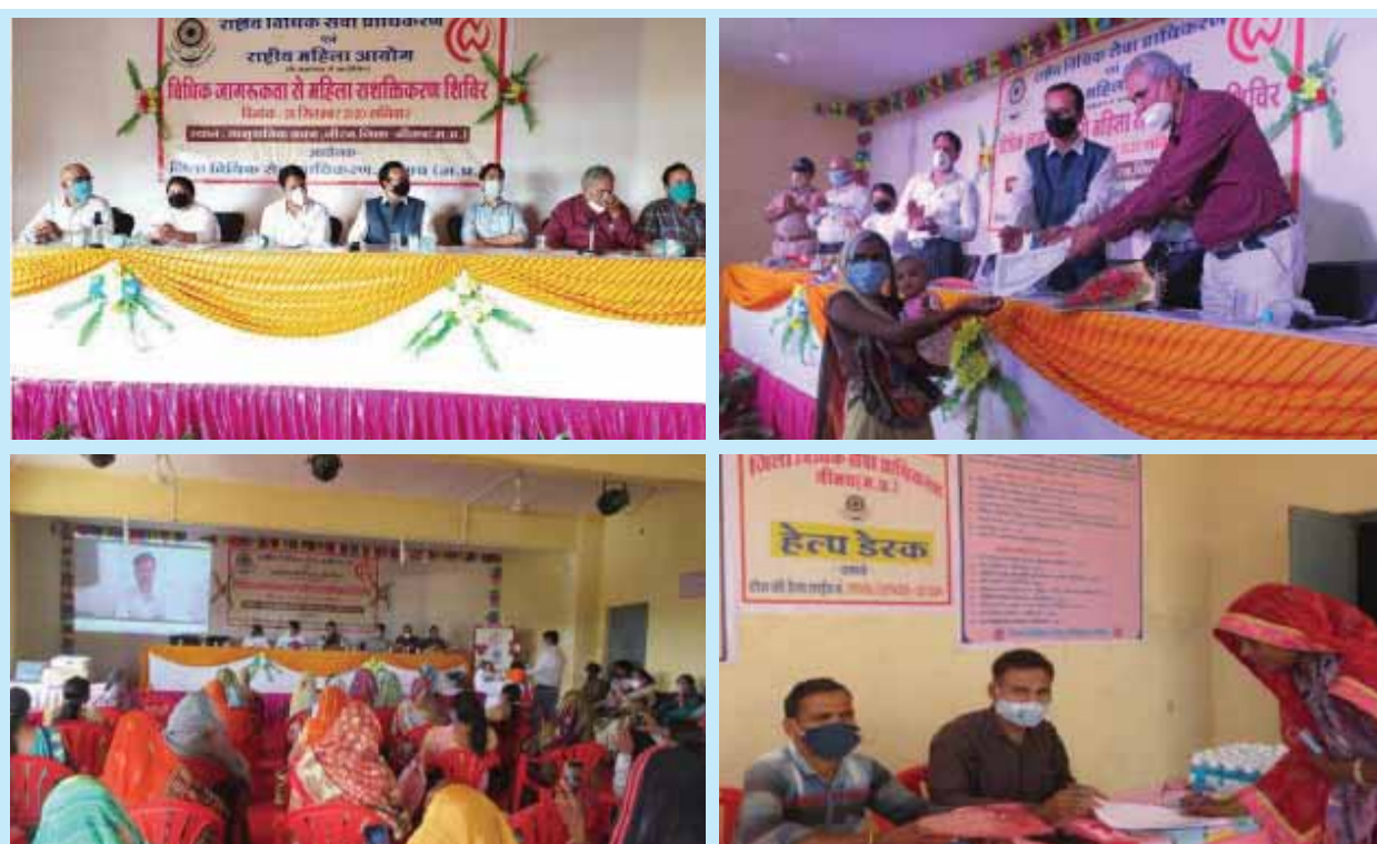
Neemuch, Madhya Pradesh