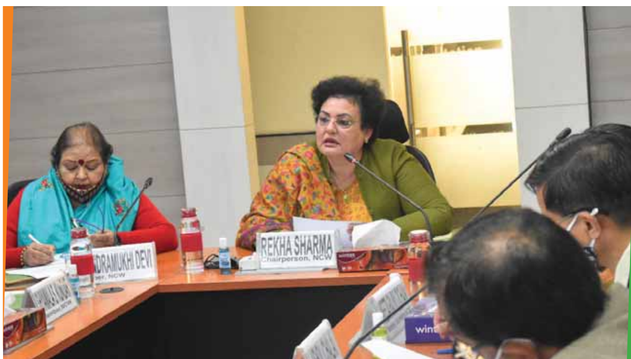
Chairperson during the meeting with SCW.