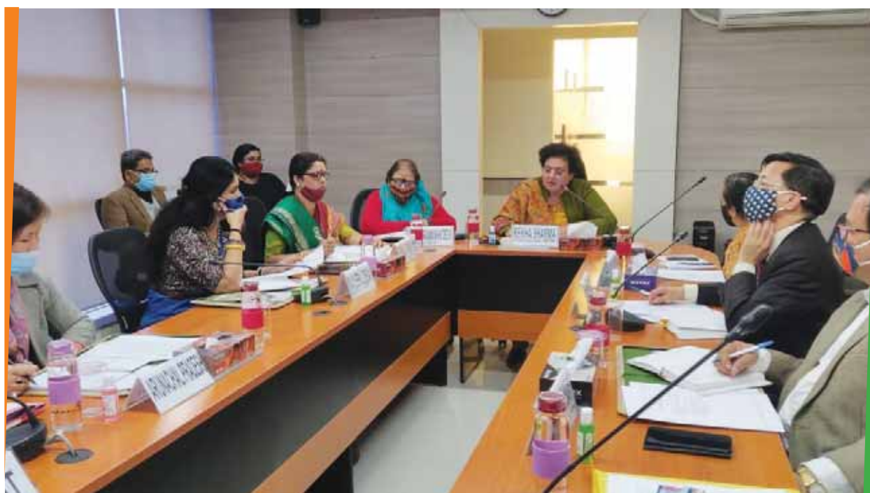
Interaction meeting with State Commission for Women.