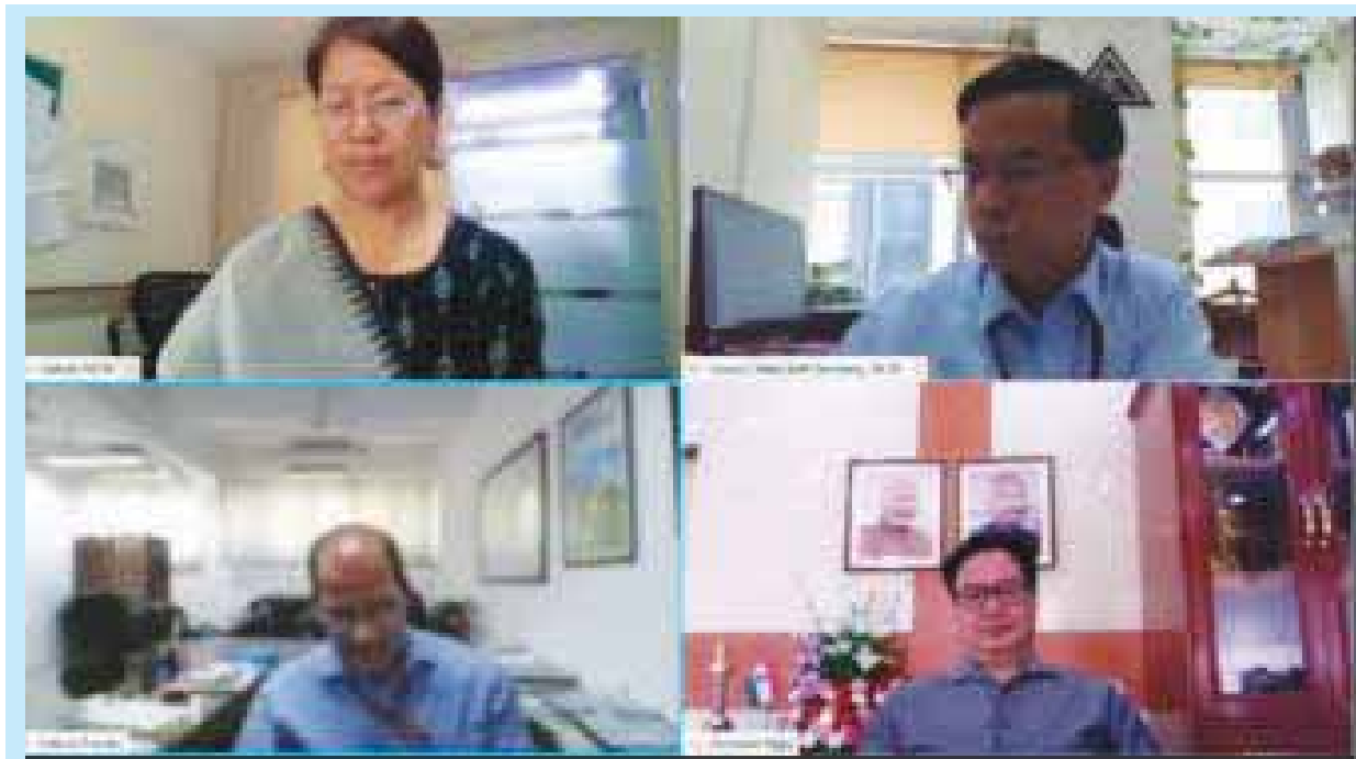
Union Minister Shri Kiren Rijju in NCW's Mega Webinar