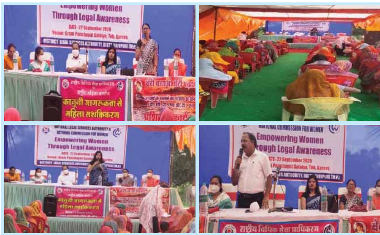
Shivpuri, Madhya Pradesh