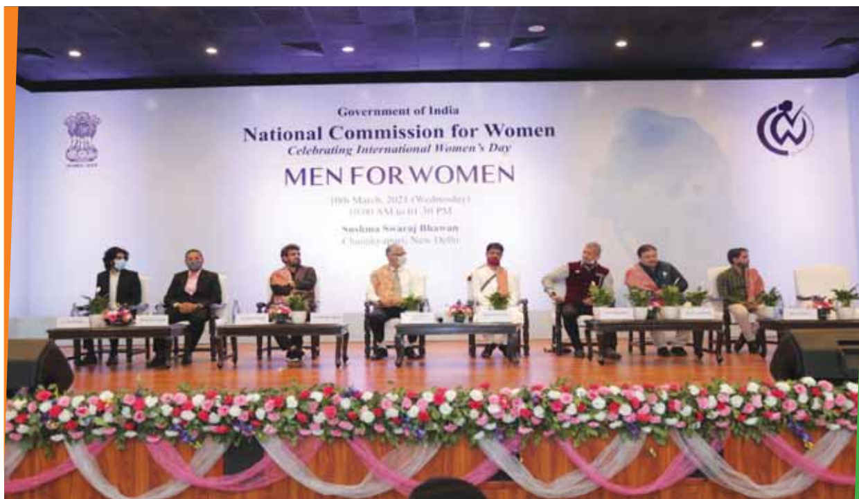
NCW invited male dignitaries for felicitation