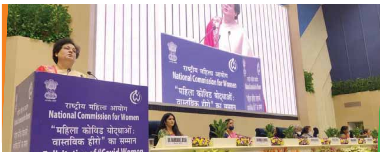
Chairperson addressing the gathering at the Foundation Day