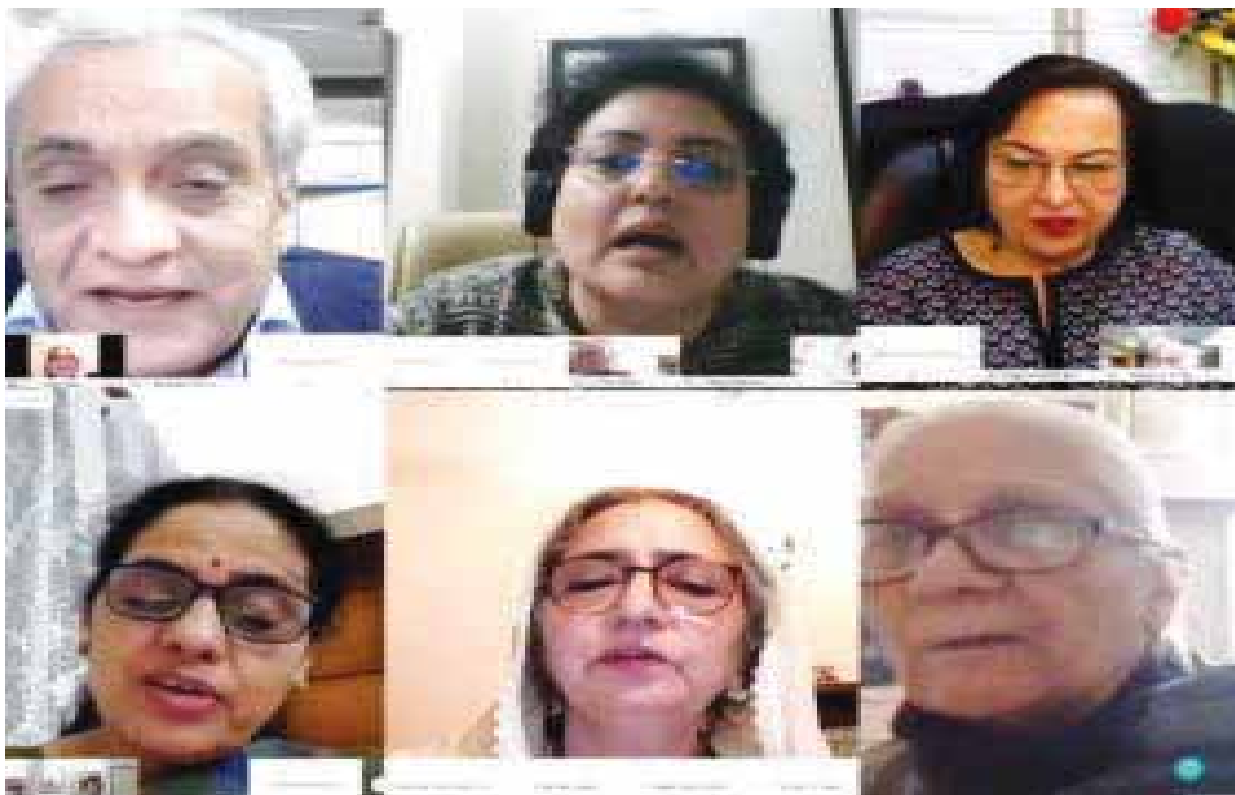
Seminar on “ Domestic Violence against Women-it’s a Men’s issue”