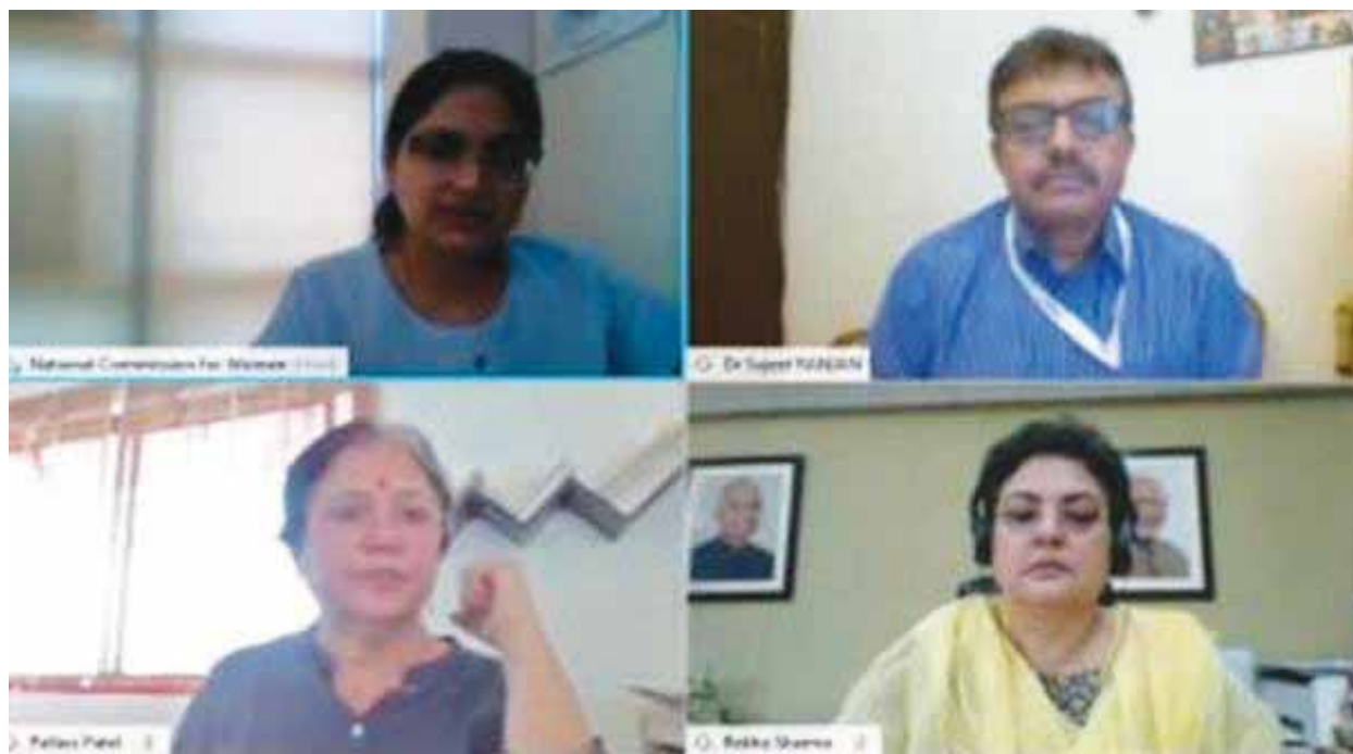
NCW Webinar conducted to celebrate Poshan Maah 2021