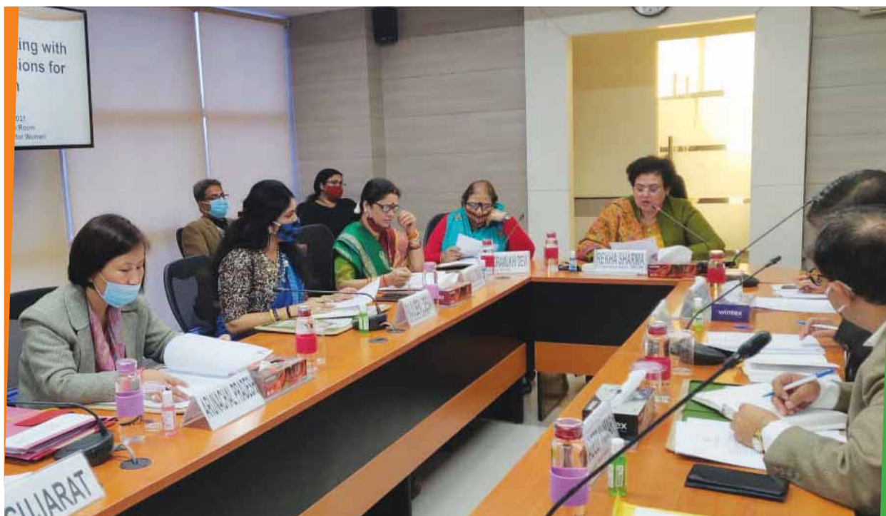
Chairpersons of SCW during Interaction Meeting.