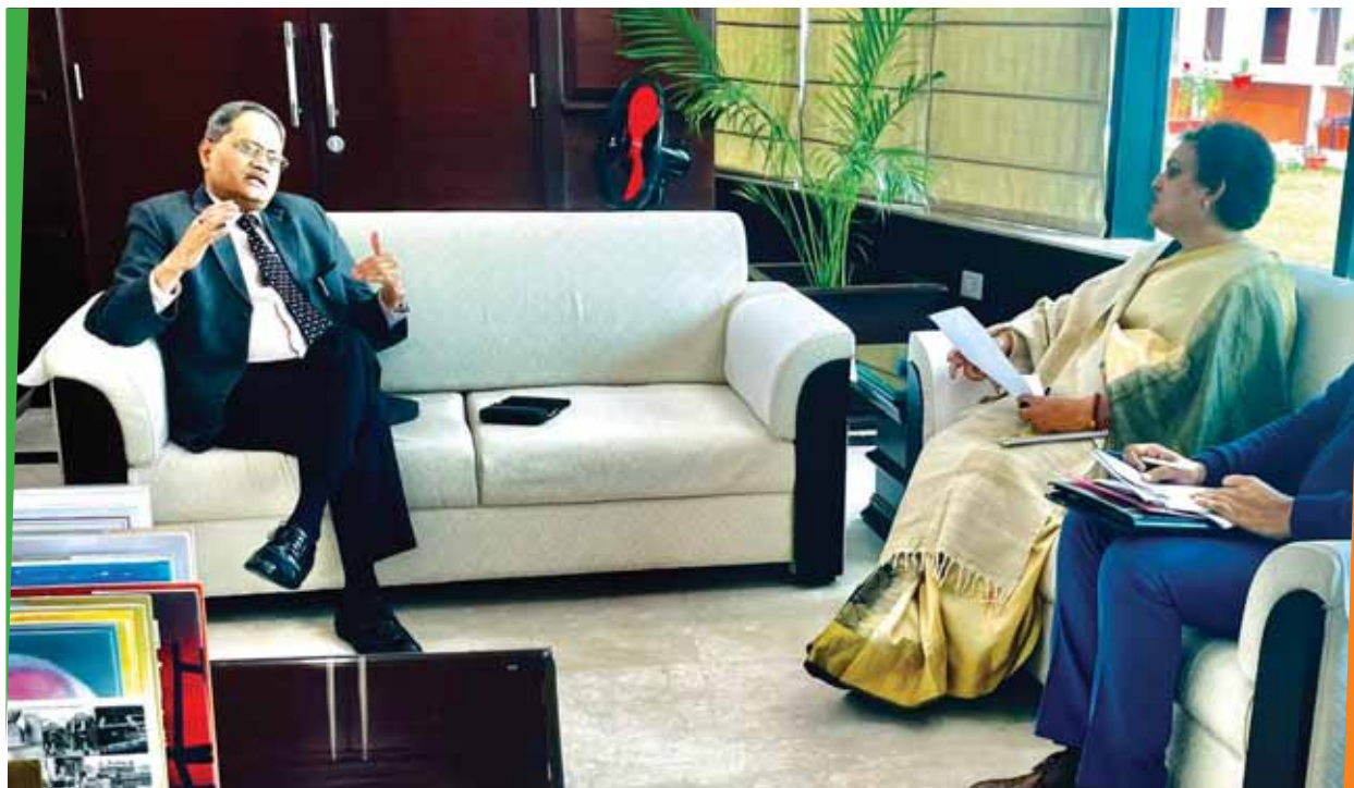
NCW Chairperson meets UP DGP, discusses role of police in women safety (20 th January, 2021)