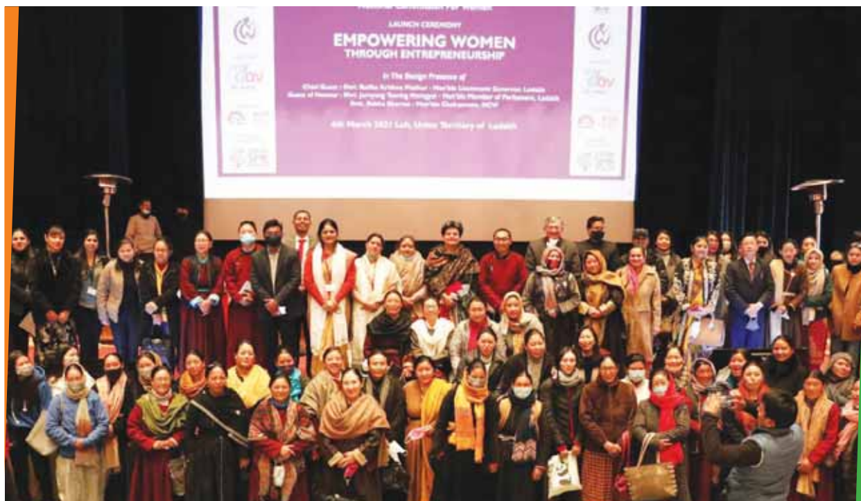
Launching of Program “Empowering Women through Entrepreneurship” at Leh