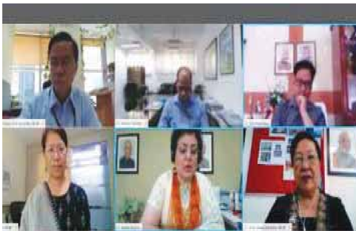
Webinar on problems faced by North Eastern women in Metropolitan cities