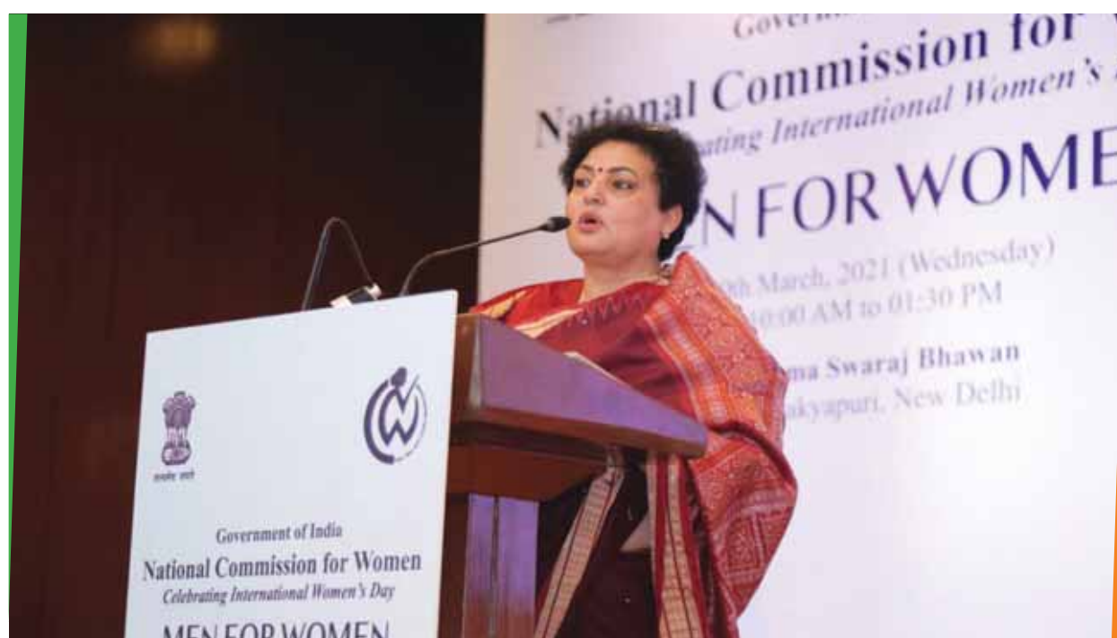
Chairperson Speaking at the event.