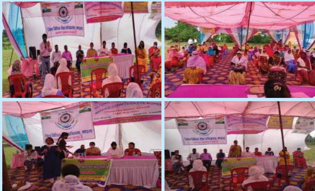
Mandla, Madhya Pradesh