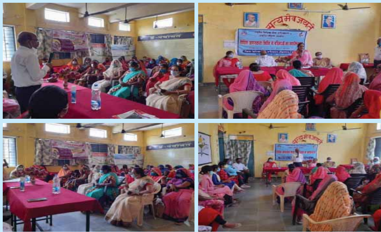
Tikamgarh, Madhya Pradesh