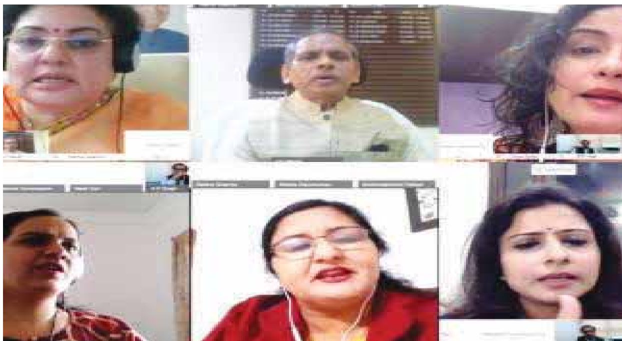
NCW organized an 18 hours virtual discussion titled “ India against abuse of Women”