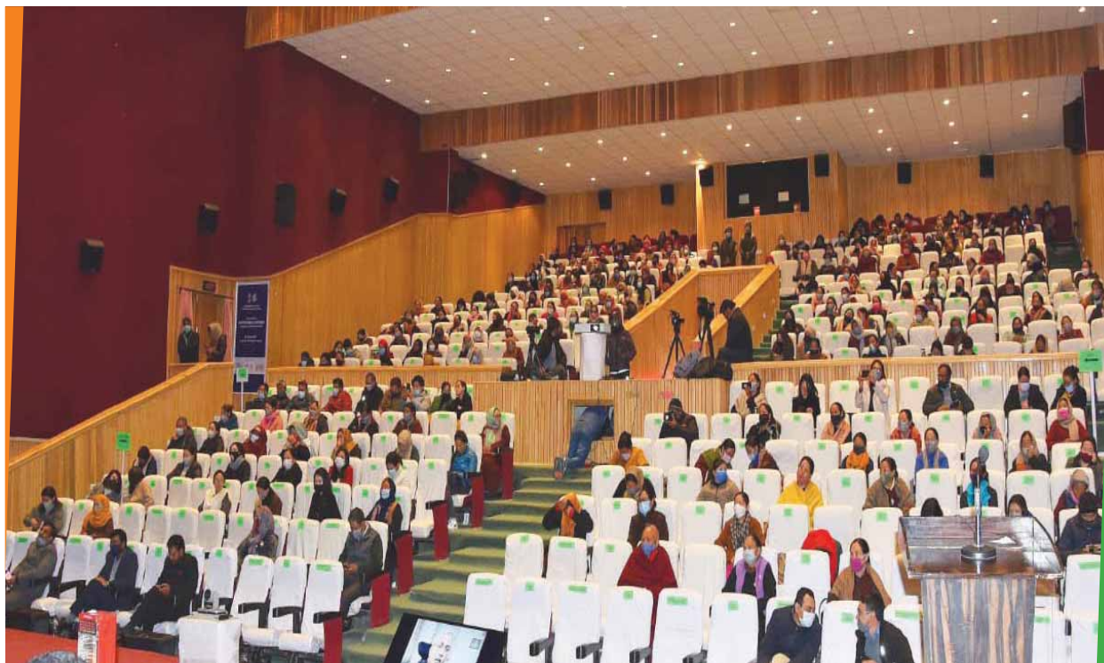
Launch being attended by Local Women Entrepreneurs at Leh