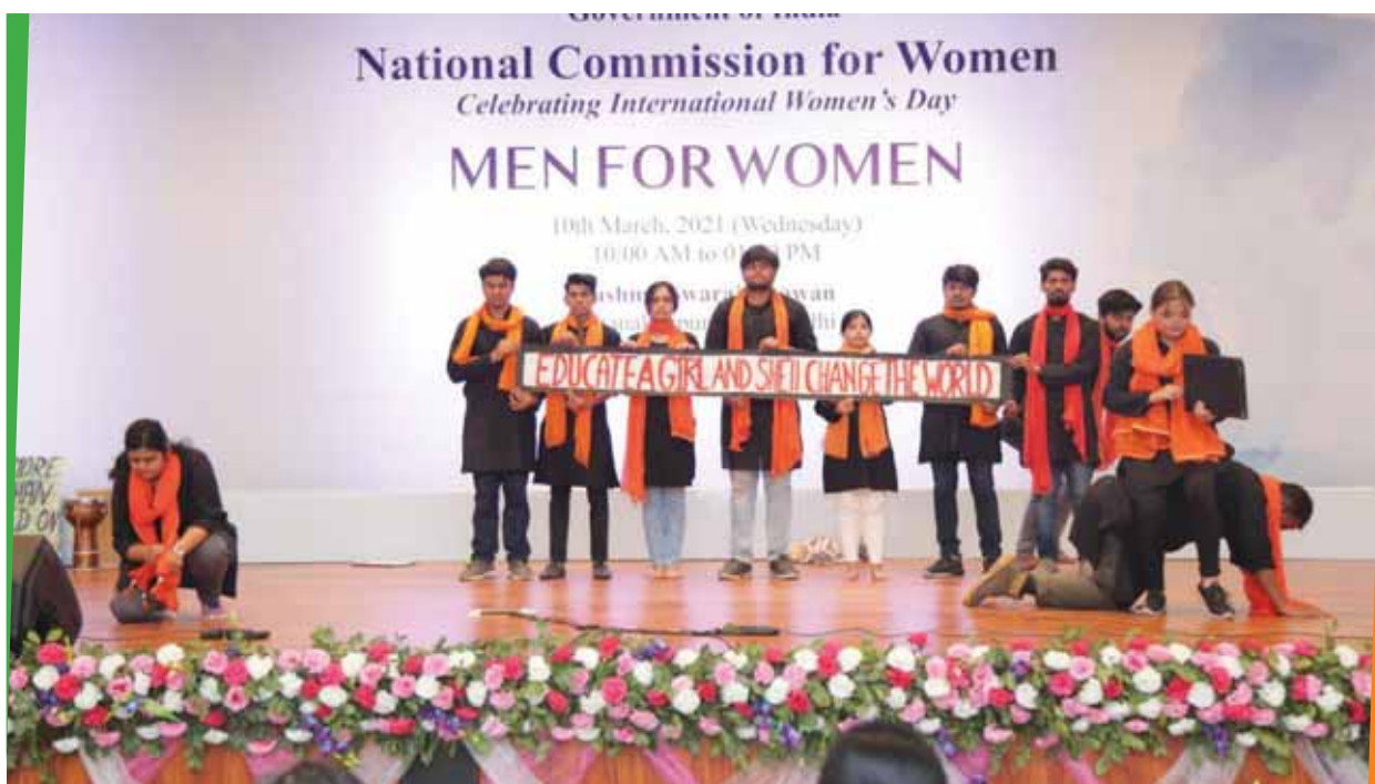
Play on education of girl children