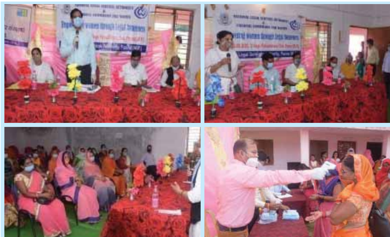
Panna, Madhya Pradesh