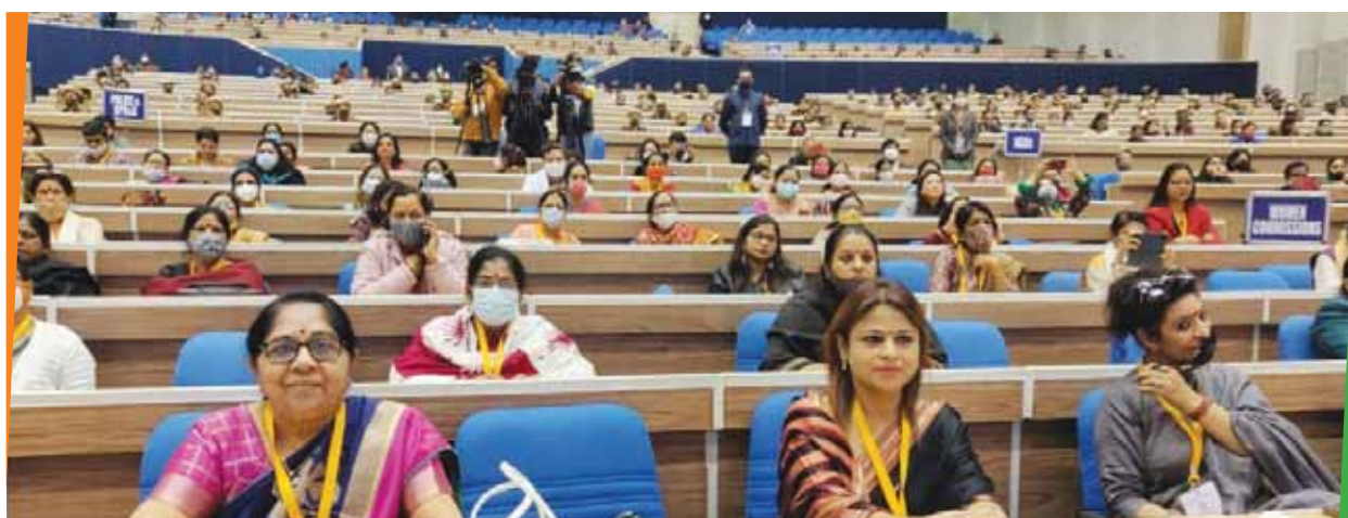
Chairpersons of State Commissions for Women in attendance