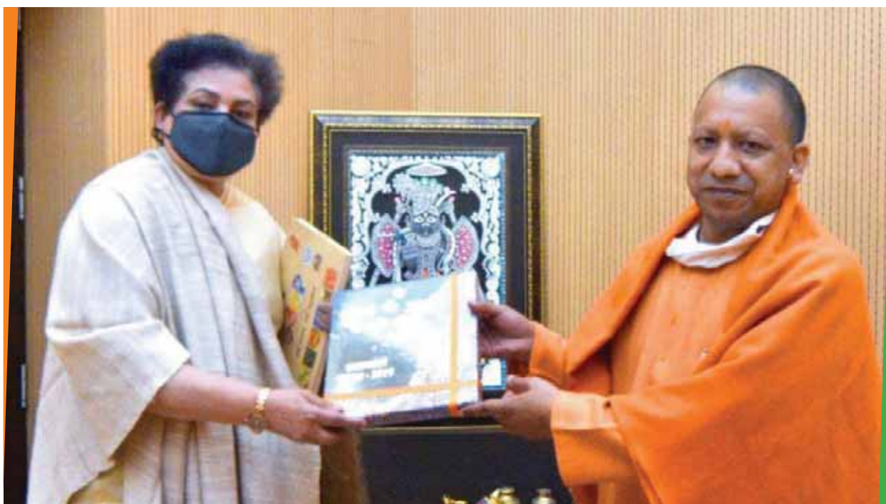
Chairperson met Hon'ble Chief Minister of Uttar Pradesh Shri Yogi Adityanath and discussed issues related to welfare of women in the State. (20 th January, 2021)