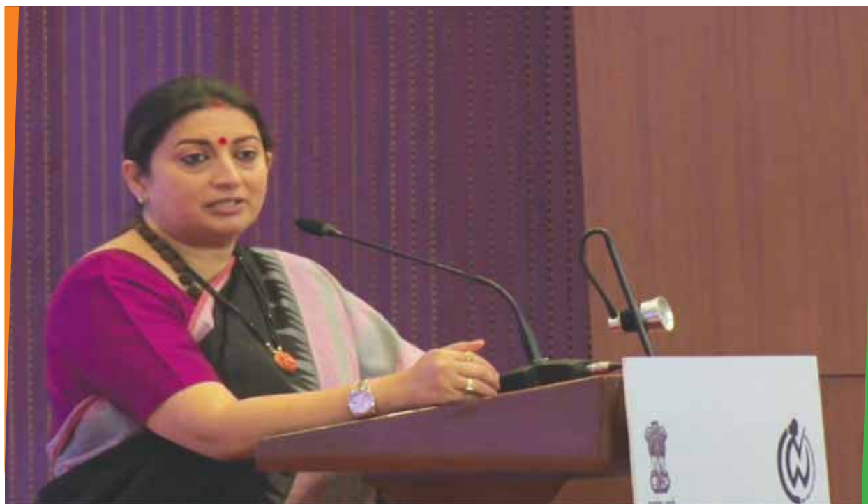
Union Minister Smt. Smriti Zubin Irani addressing the event