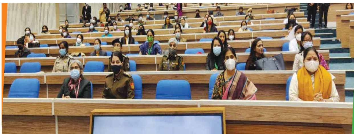
COVID Women Warriors were felicitated for their extra ordinary service during the Foundation Day of NCW (31 st January, 2021)