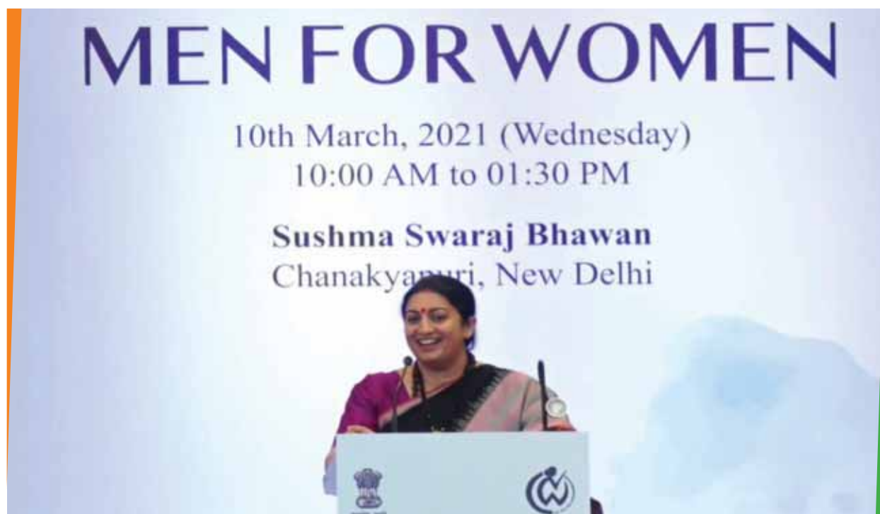
WCD Minister Smt. Smriti Zubin Irani Speaking at NCW's Event "Men for Women"