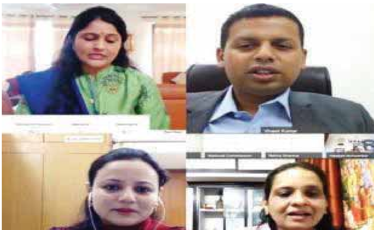
Seminar on “How online abuse of Women has spiraled out of control”