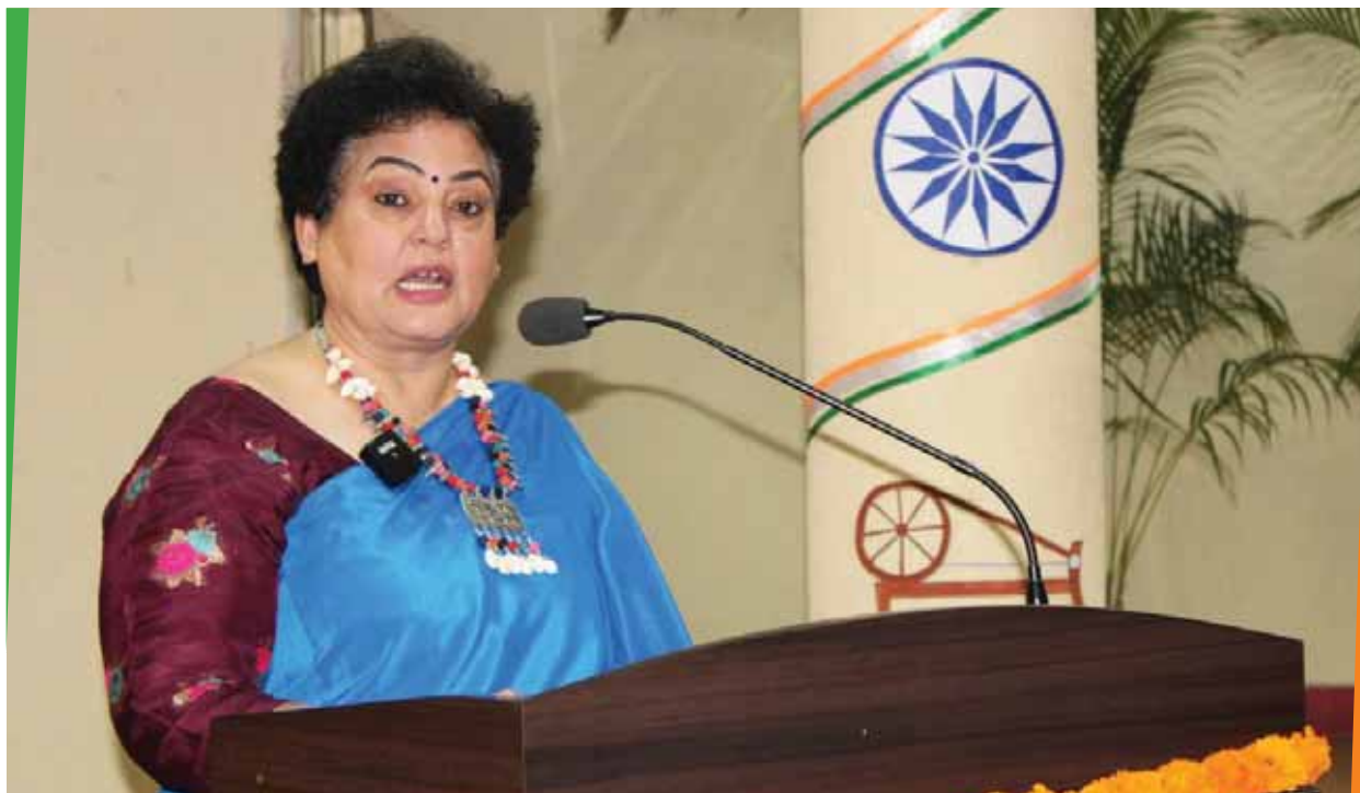
Chairperson Rekha Sharma held a meeting with Internal Committee of the Colleges under Punjab University and chaired a workshop on “Sexual Harassment of Women at Work Place (Prevention, Prohibition & Redressal)” organized in collaboration with NCW. (25 th March 2021)