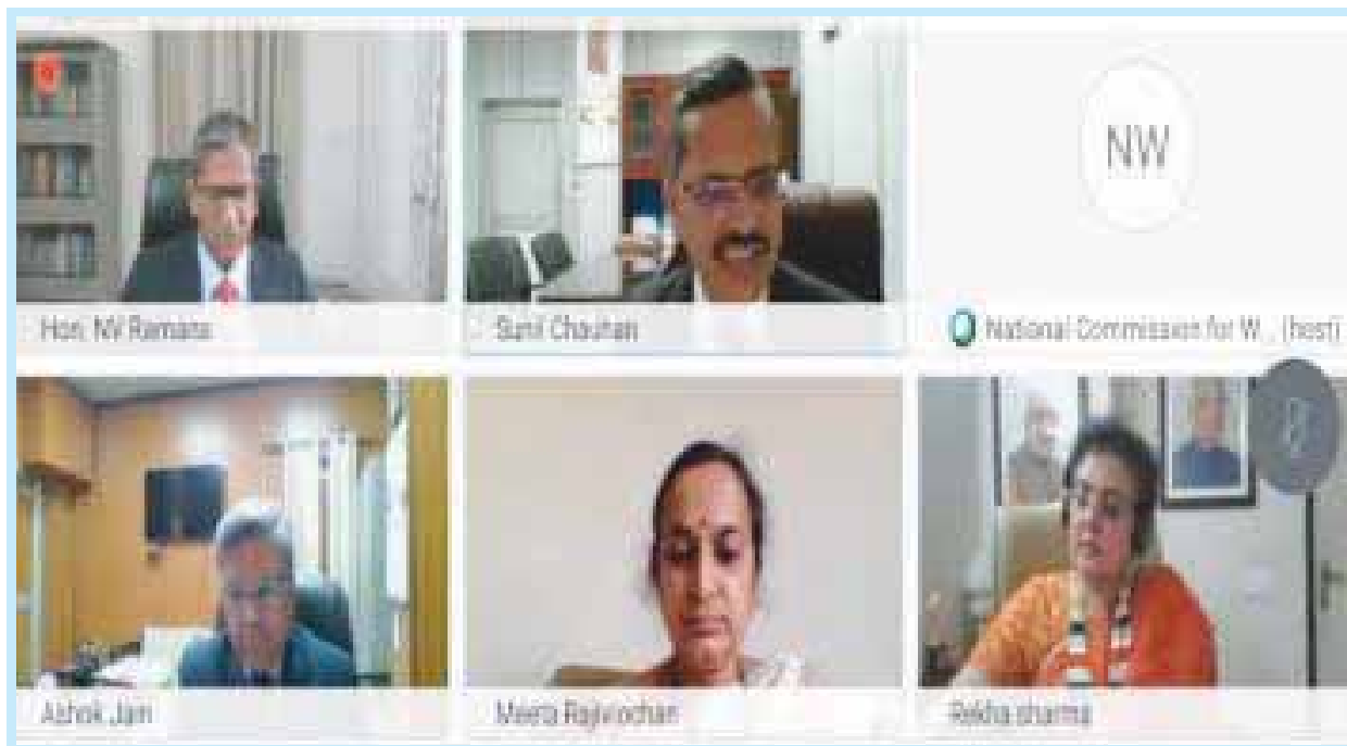
Launch of Legal Awareness Program with NALSA