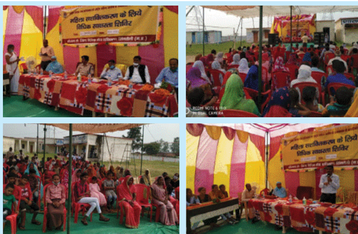
Legal awareness camps held in collaboration with NALSA