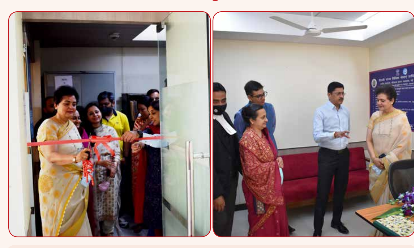
NCW launched a Legal Aid Clinic on 29 March 2022 in collaboration with the Delhi State Legal Services Authority to make legal aid more accessible for women.