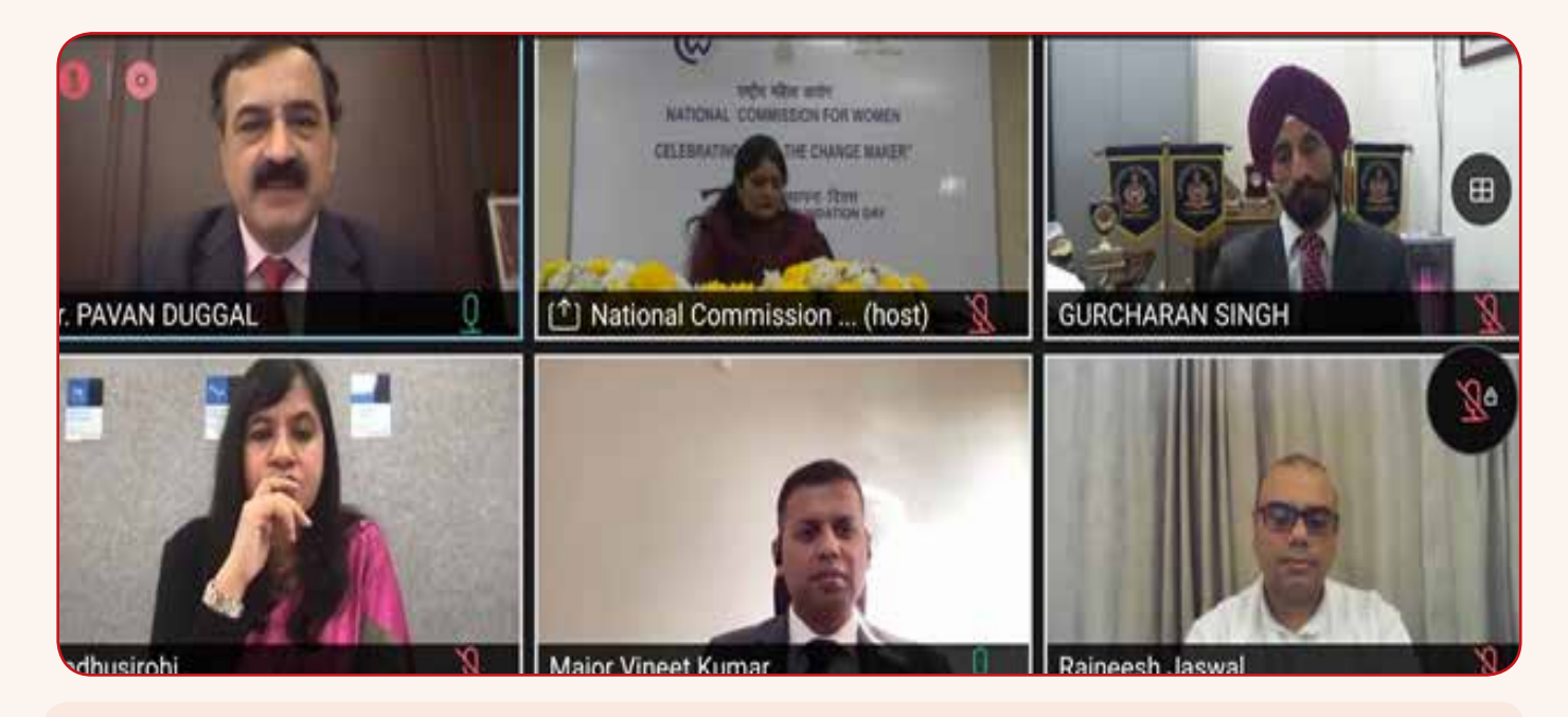
Technical Session 3 - Digital Empowerment of Women