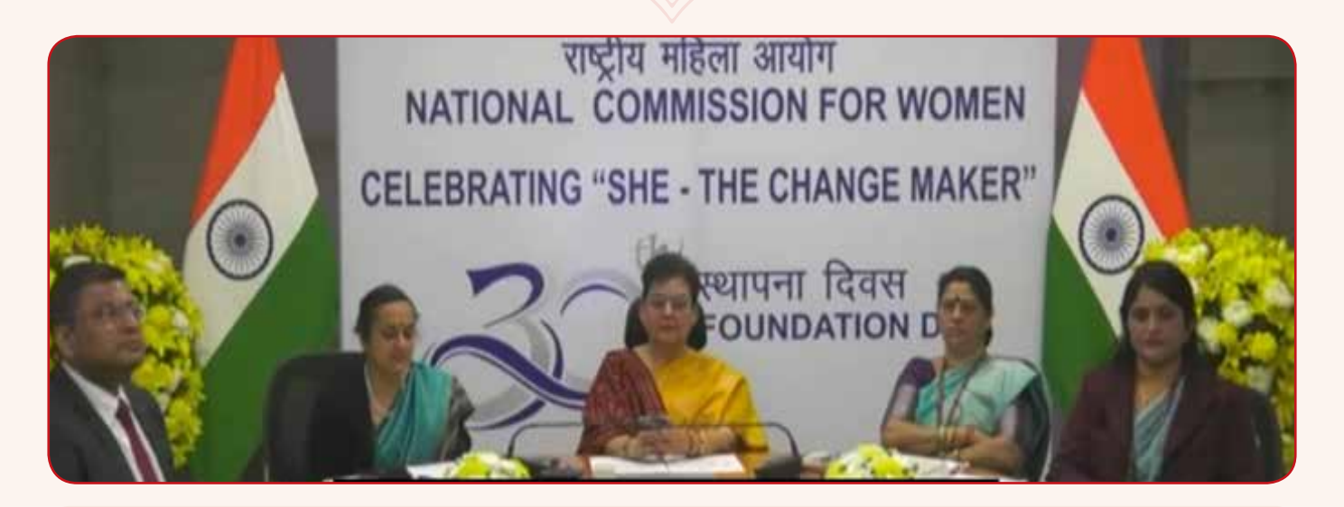
NCW celebrating 30th Foundation day on the theme She-The Change Maker