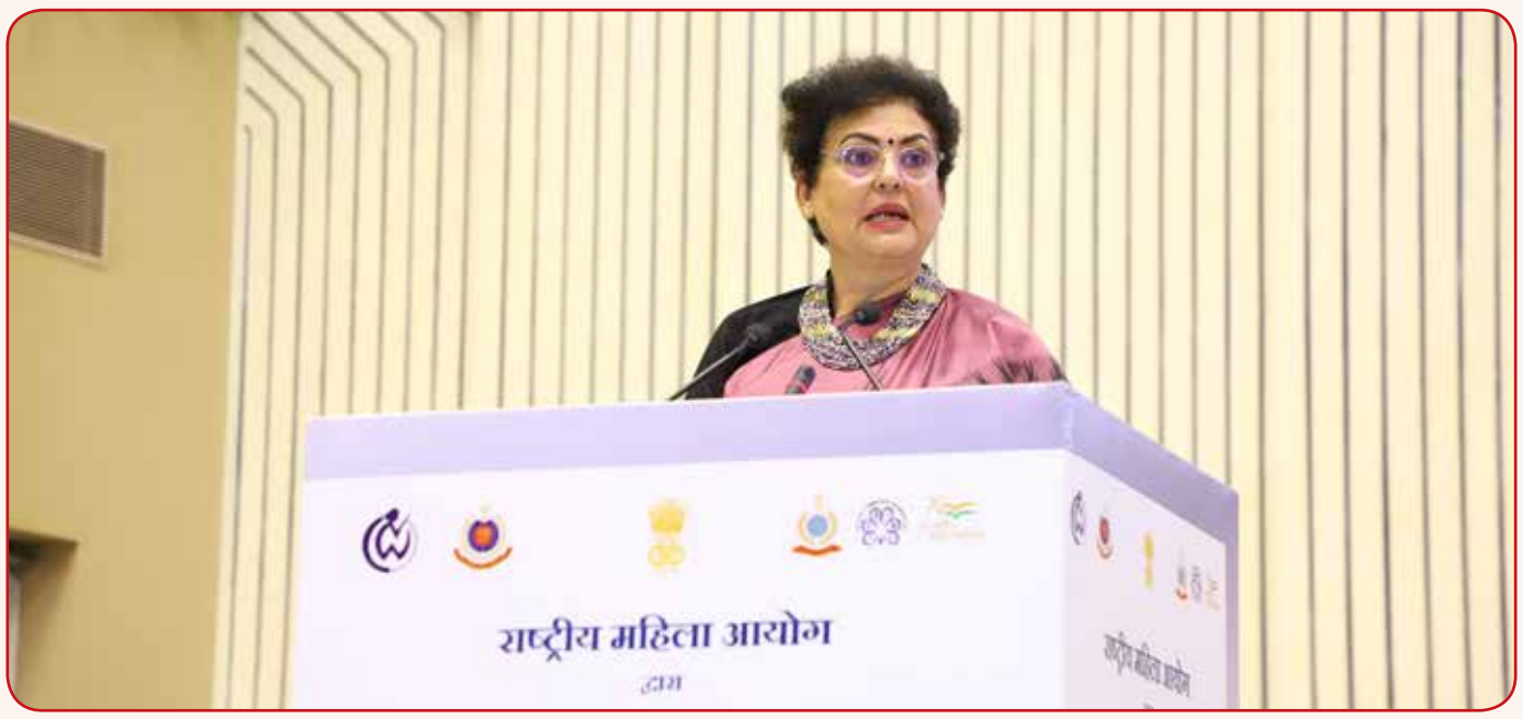
On March 26, 2022, NCW organized a seminar on 'Racial Diversity Sensitization' in collaboration with Bureau of Police Research & Development, National Commission for Minorities and Special Police Unit for North-Eastern Region (SPUNER) of Delhi Police to spread awareness towards different cultures in India and to recommend strategies for strengthening mutual understanding among diverse customs.