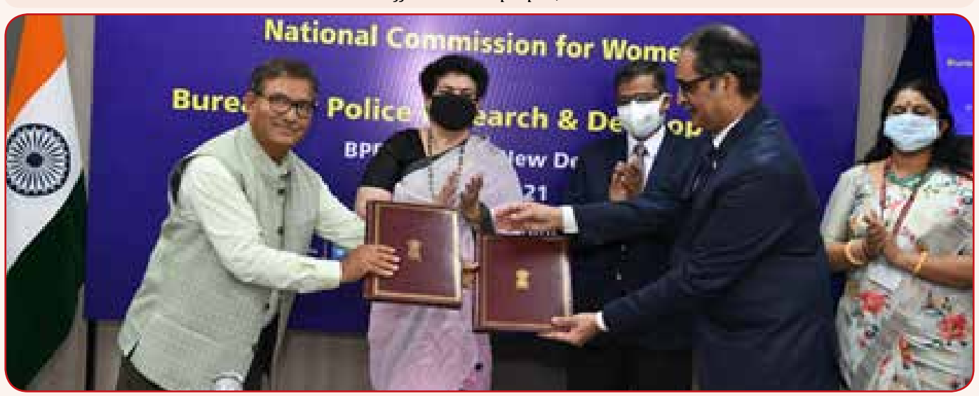
NCW signed a Memorandum of Understanding with Bureau of Police Research and Development on July 15, 2021 for gender sensitization of police personnel across the country