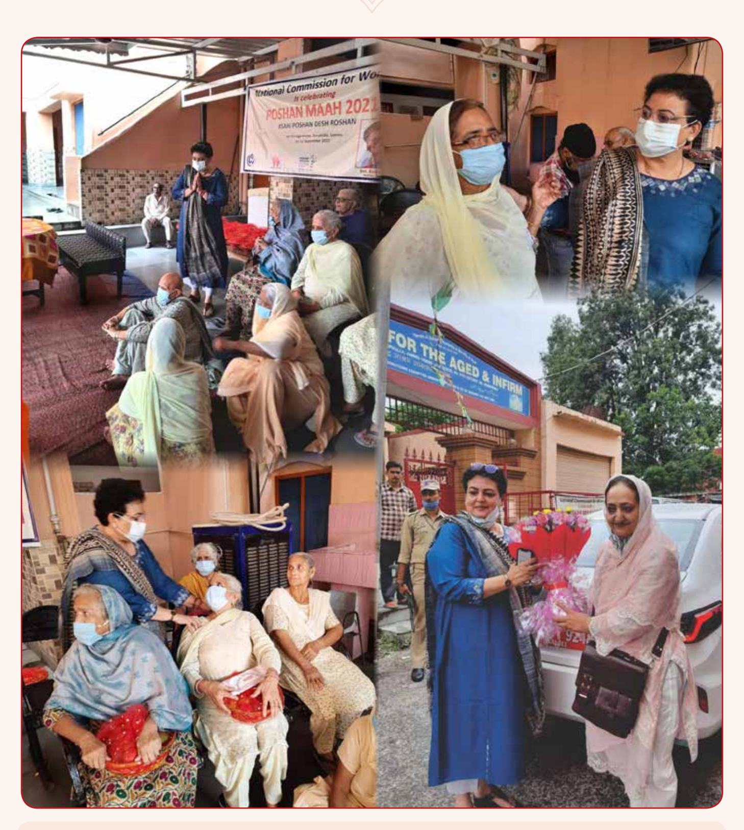
Poshan Maah - Sahi Poshan Desh Roshan