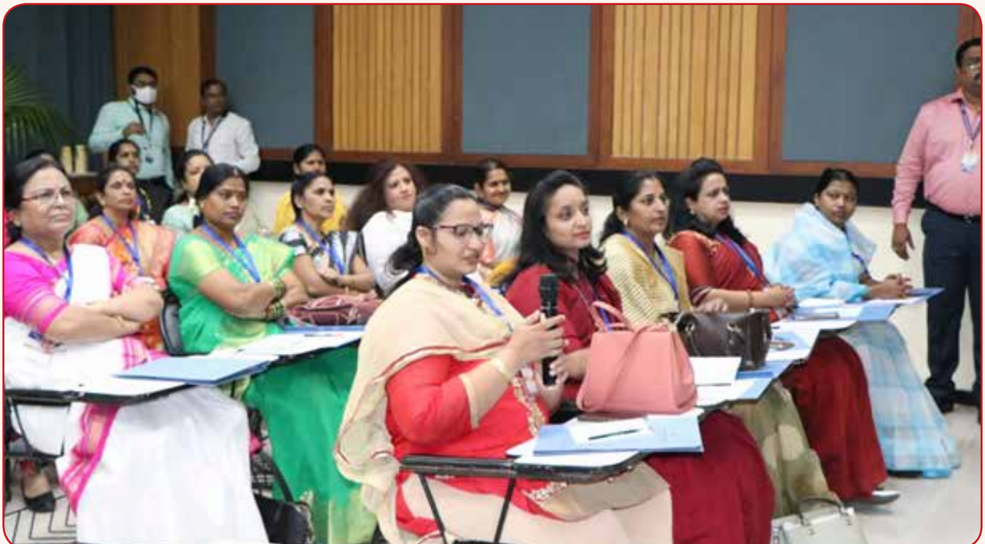
NCW launched pan-India capacity building programme 'She is a Changemaker' for women in Politics in collaboration with Rambhau Mhalgi Prabodhini