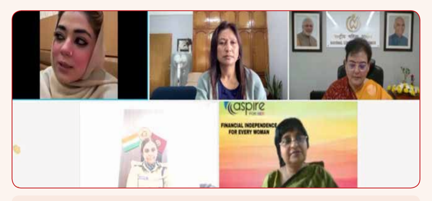
Technical Session 2 - Women in Decision Making