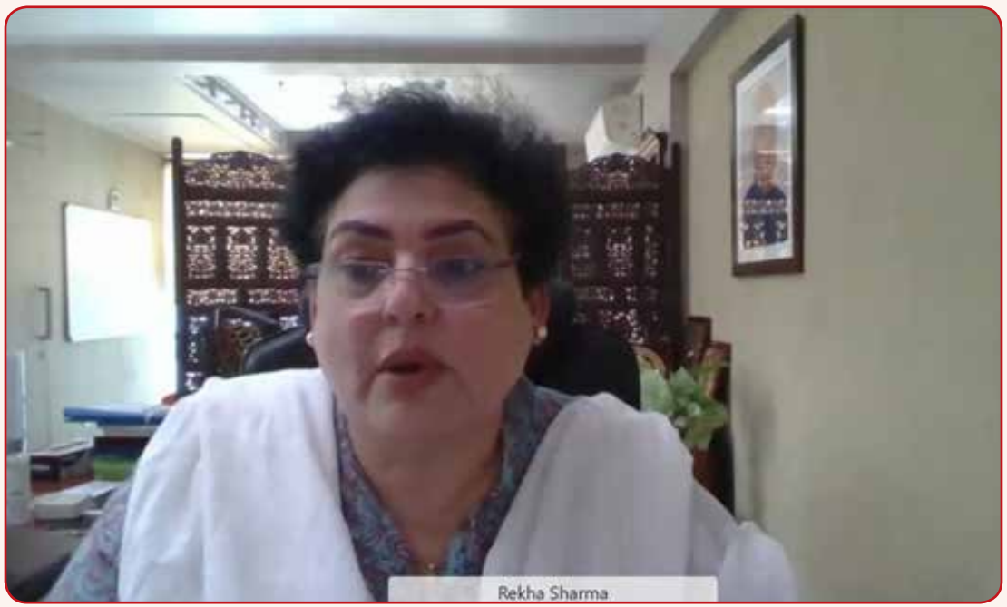
NCW held a Webinar on Health and Physical Wellbeing of Women on 27 April 2021